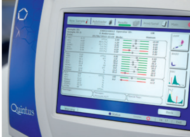
Plenty of room to display all 26-parameter results plus scattergrams and histograms, warnings, messages and flaggings.