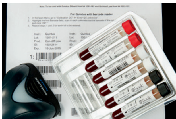
Advanced quality control functions include Levey-Jennings charts.

Boule QC materials (Boule Con-5Diff G2 and Boule Cal-5Diff G2) ensure that Quintus performs accurately and delivers quality-controlled hematology results. Like the reagents, both use barcode scanning for secure handling and assay sheet registration, which minimizes the risk of error when manually entering control reference values. Advanced quality control functions built into Quintus software include Levey-Jennings charts, XB-function and QC reports. Low need for daily maintenance makes the daily operation easy. Service and support is available from certified providers.