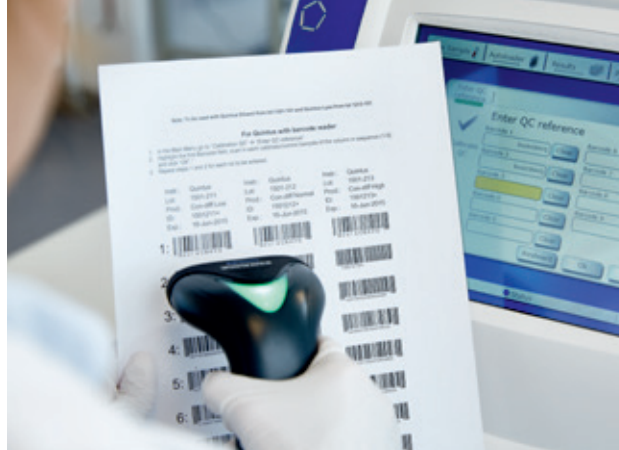
Barcode scanning of QC material assay sheets is easy to use and 100% secure.