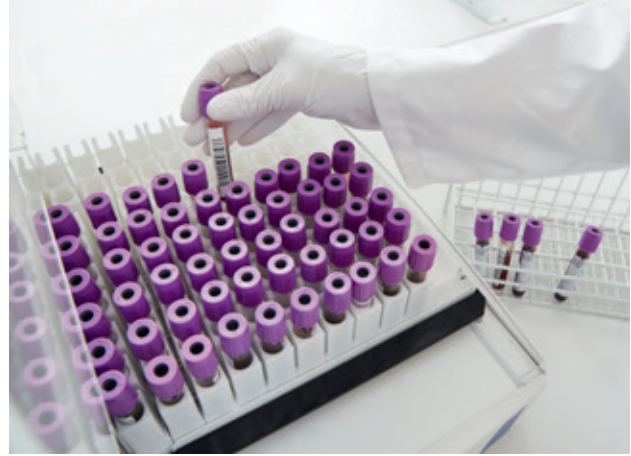
The Quintus Autoloader has room for 100 samples and comes with an integrated barcode reader.

The Quintus Autoloader is a compact, easy-to-use option for users who value letting their instrument get on with the analyses. It makes Quintus the perfect walk-away system for laboratories with high workload. Just pre-load up to 10 x 10 samples and let it do the work. The Autoloader tilts and rotates every tube, to get a proper mixing, and reads its barcode. Most standard closed EDTA tubes fit and the cap will be detected by a cap recognition sensor. Note that emergency samples can easily be analyzed in the middle of an automated run.