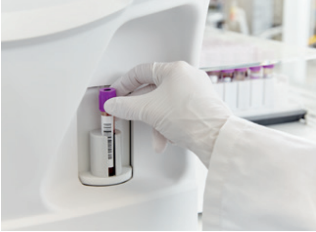
Quintus samples from a single-tube inlet for open or closed tubes, that also can handle micro tubes.