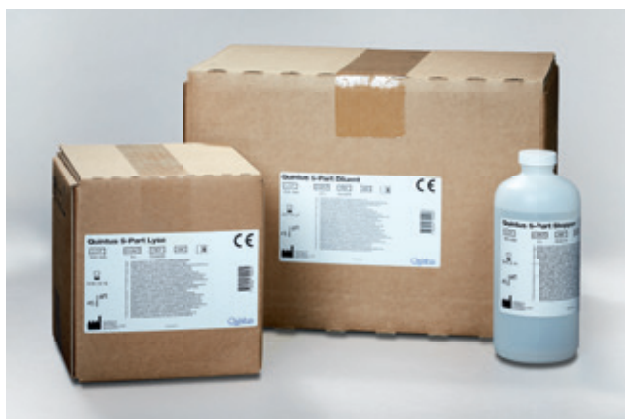
Simple reagent logistics, smooth operation and reduced running costs.

*For safety and environmental reasons, the lysing reagent is cyanide-free.