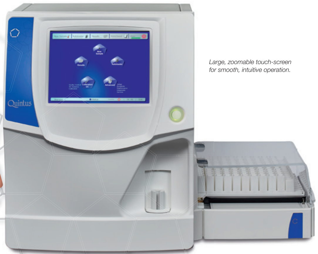
Large, zoomable touch-screen for smooth, intuitive operation.

Quintus brings together a high-quality instrument with integrated workstation, easy-to handle reagents and a large-format, user-friendly interface. It's a complete 5-part hematology system delivering accurate and reliable CBC results with the choice of work-saving walk-away automation.